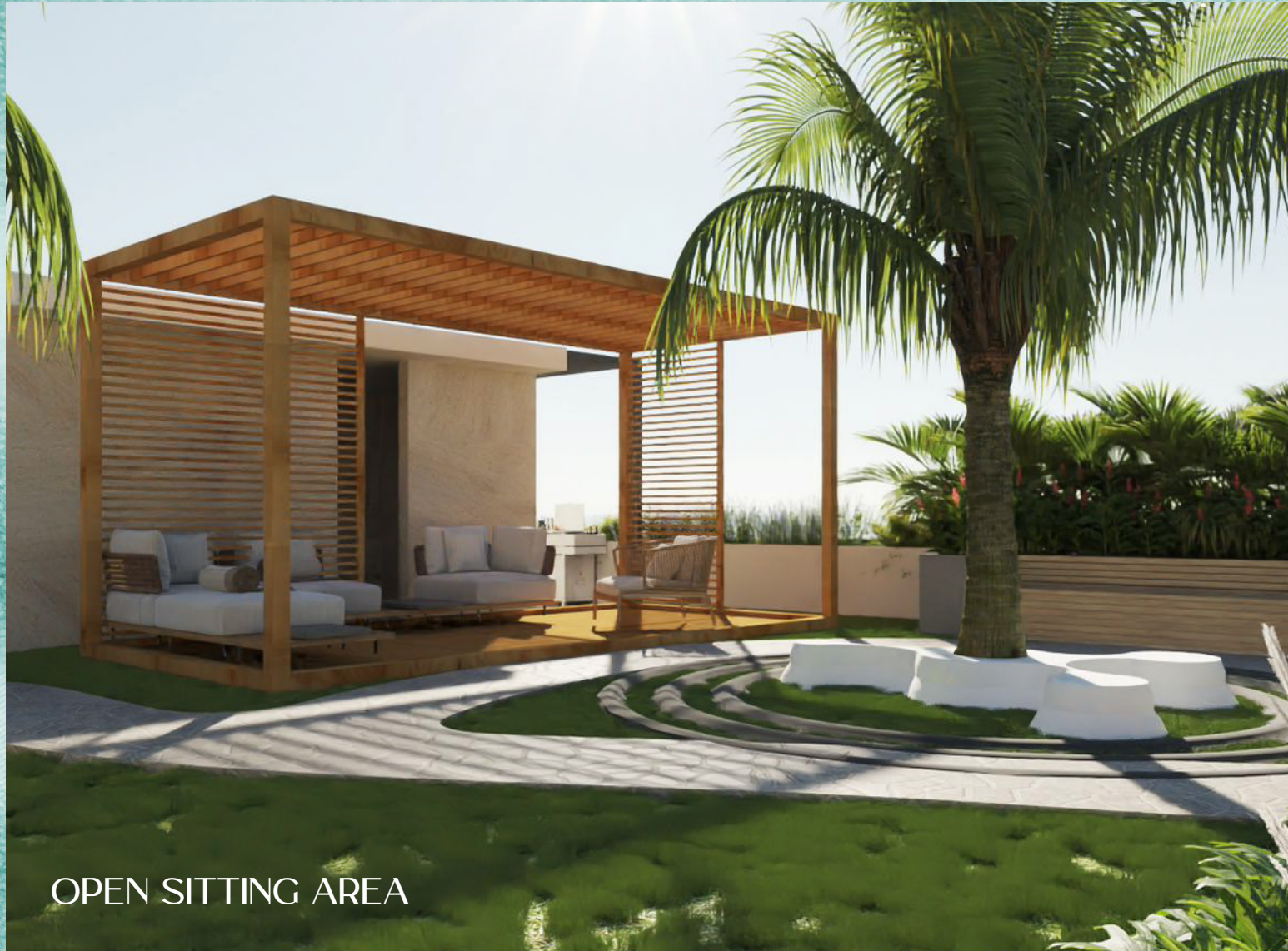
OPEN SITTING AREA